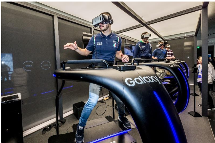
Snowboarder from Italy, Omar Visintin experiences simulated Olympic Snowboarding through 4D motion virtual reality at the Samsung Olympic Showcase in Gangneung Olympic Park in South Korea. The film is displayed through the Samsung Galaxy smartphone and compatible Gear VR.